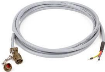
DC power supply cable