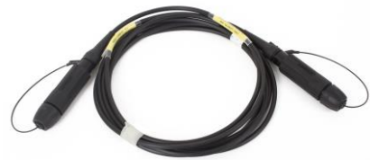
Tactical cable with HMA-J connectors

Note: 7) When -PD (PoE powered device) ordered – no power supply cable required