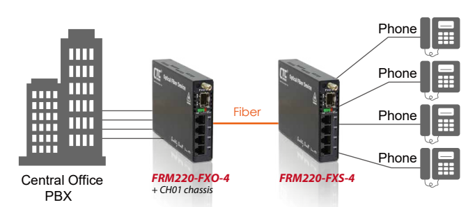
Figure 2 : Voice transmission from 2km to 120km over fiber